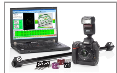
DPA Measuring System

With a high resolution digital camera the pictures are taken in minutes without using a tripod. The ring flash which is fixed on the camera assures the even illumination of the retro reflecting target marks.