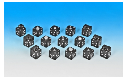
• Cube shaped adapters