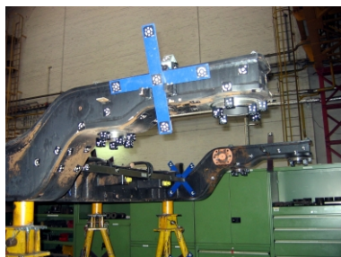
➤ Signalized bogie

In order to be able to measure the relevant points, the bogie is furnished with two steel scale bars and a reference cross, to give the measuring system dimensional scale and orientation. Then the geometric features to be analyzed, such as bore holes, edges or planes, are targeted with AICON “dice” - cube shaped adapters. For each bogie, between 60 and 80 adapters are necessary.