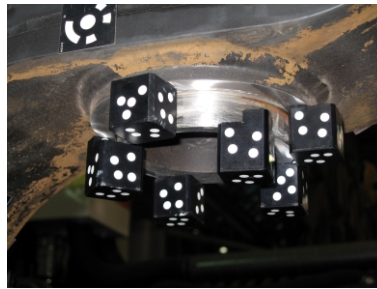
➤ Applied adapters

The acquisition of the 150 images necessary for the measurement takes about 30 minutes. Since the images are transferred directly to the analysis notebook via wireless LAN, the DPA plug-in can begin image processing and calculation of 3D coordinates during the image acquisition phase. The points being