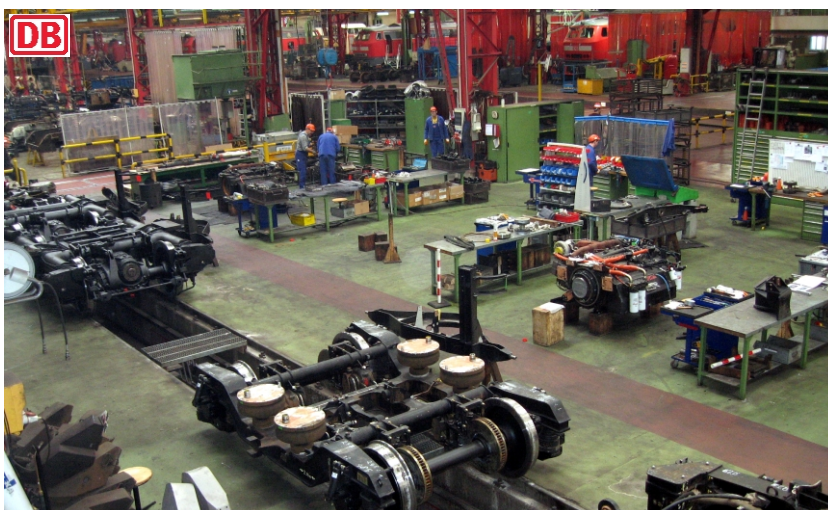
• Rework of bogies at Deutsche Bahn