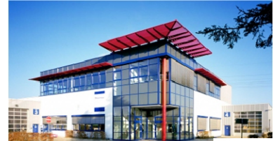
TI Automotive in Fuldabrück (Germany)

TI Automotive is, as the name suggests, a global supplier in the automotive sector. As a leading manufacturer of fuel storage and fluid carrying systems for braking and powertrain applications, the company cultivates worldwide relationships with all important automakers. Today, approximately 30 million cars built every year rely on TI's technology.