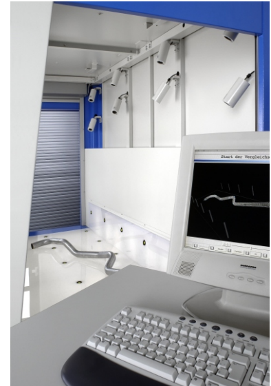
• Tube measurement

satisfies them much more than the old, usual reports. As some of our customers, for example Volkswagen, also own a Tubelnspect system, we even profit from synergy effects."