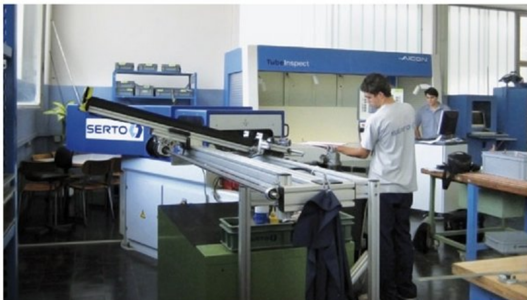
Since applying the optical measuring system, Serto AG in Switzerland has been able to reduce material costs significantly

measuring plate and acquire images of the tube from different directions. Evenly distributed reference points on the measuring plate guarantee for the correct spatial orientation of the cameras. Aicon defines their positions accurately to a hundredth millimeter during the installation of the system. The result display is easily understandable, also for users without technical background. Thus it allows for flawless evaluation of the measurement.